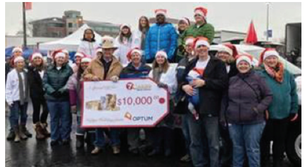
7Cares Idaho Shares day in Boise, Idaho