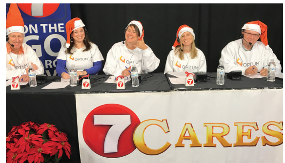
Optum Staff volunteering at the phone bank for 7Cares Idaho Shares